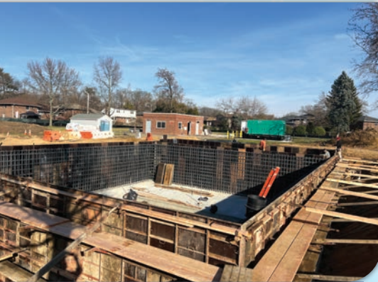
Work being completed at Wells 3 & 4