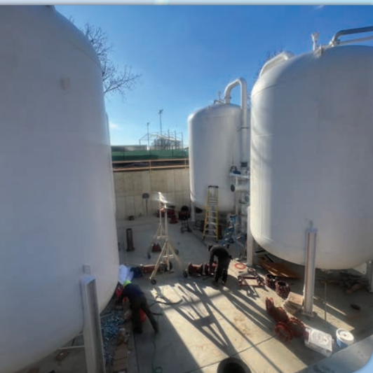
Granular Activated Carbon Vessels at Wells 3 & 4