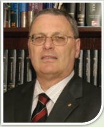
Commissioner Italo J. Vacchio

With the warmer weather upon us, the Carle Place Water District wants to remind all residents that together we can make a difference in our water conservation efforts. We draw water from a plentiful, sole source aquifer located right below our feet and we endorse conservation as a means of ensuring sustainability for our current and future generations. Here are some ways we can make a difference: